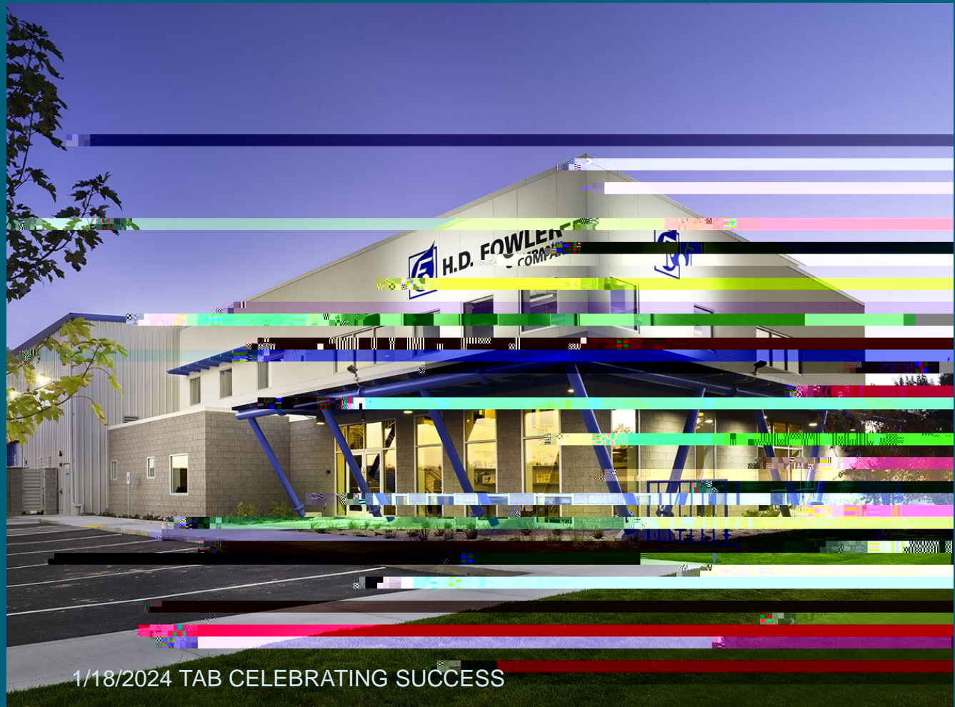
1/18/2024 TAB CELEBRATING SUCCESS